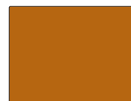
Orange Oxide (1605 C)