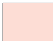
Light Rose (489 C)