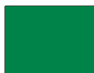
Green (356 C)