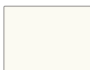
Raw White (5807 C)