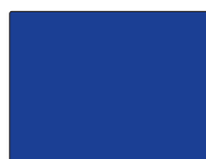
Electric Blue(072 C)