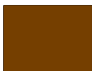
Tobacco (732 C)