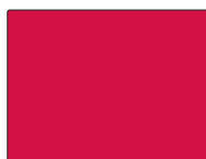
Light Red (200 C)