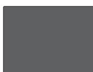
Flannel grey (425 C)