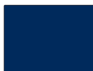
Navy Blue(289 C)