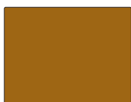
Arena (464 C)