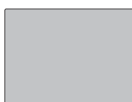
Light Grey (422 C)