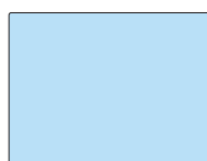
Sky Blue (290 C)