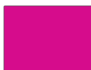
Magenta (233 C)