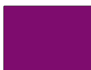
Deep Purple (249 C)