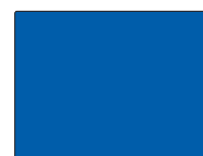
Royal Blue(286 C)