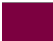
Bordeaux (222 C)