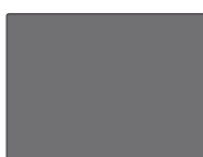
Dark Grey (Cool 11C)