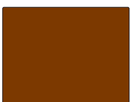
Burnt Henna (175 C)