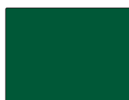
Dark Green (3435 C)