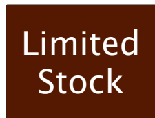
Mink 0.75mm 3.3 Dtex (Pantone 4975)