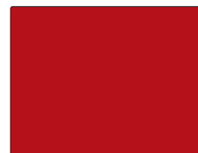
Crimson 2.0mm 22 Dtex (Pantone 1807C)