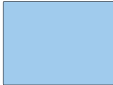
Powder Blue 0.75mm 3.3 Dtex (Pantone 283)