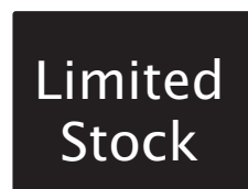
Black Random 0.3 to 0.9mm 3.3 Dtex