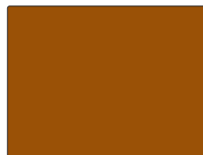
Ginger Bread 4.0mm 22 Dtex (Pantone 7517C)