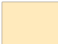
Peach 2mm Trilobal 22 Dtex (Pantone 134C)