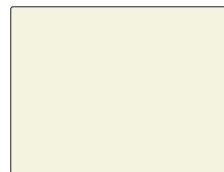
Lint 1.5mm 6.7 Dtex (Pantone 5793)