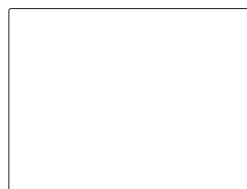
White 0.75mm 3.3 Dtex